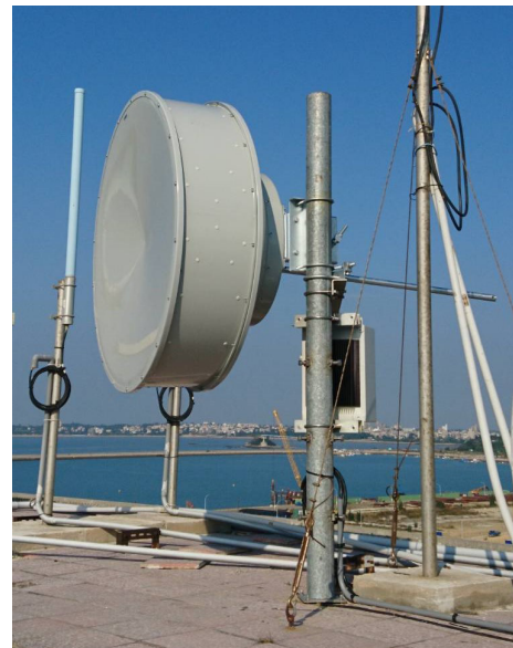
KM Microwave Link

for frequency converters or any other equipment. The microwave system provides Cable TV service to the cable subscriber in the Island without the need to install a new headend.