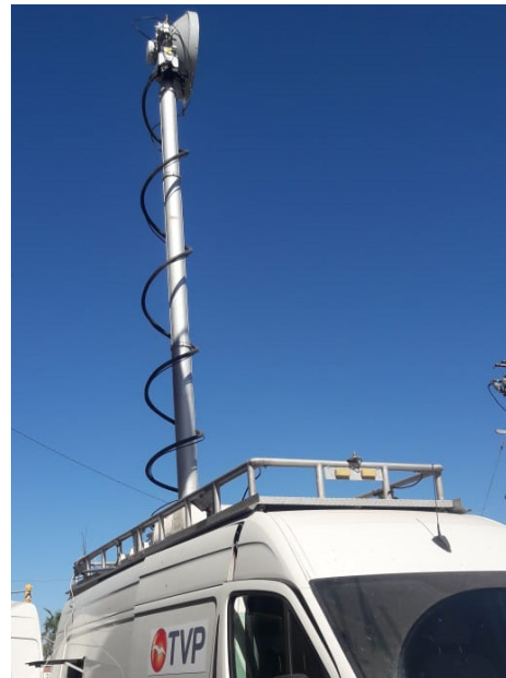
TVP van with Transmission mast and antenna