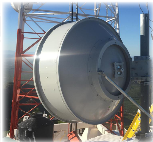
Installation of receiver antenna