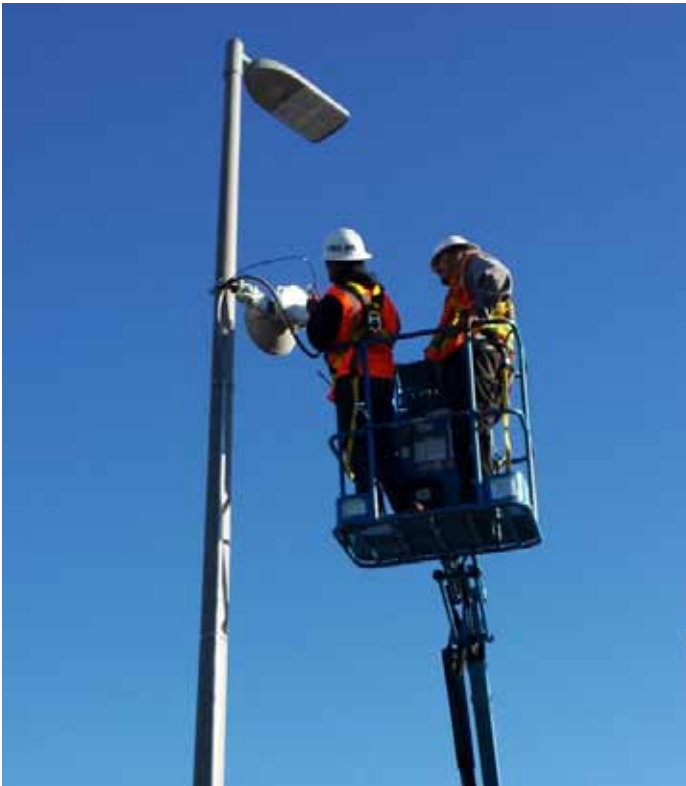
Cable AML team installing the IP radios.

Cable AML has recently installed a high capacity IP link operating in the 24 GHz “license-free” to provide backhaul connectivity between two major facilities near the Los Angeles International Airport, in Los Angeles, California (USA).