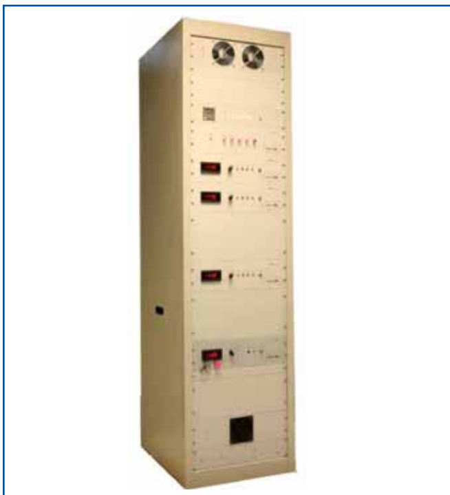
Broadband High Power AML Transmitter

Cable AML designs and manufactures broadband microwave systems for transmission of multichannel digital Cable TV signals to locations difficult to access or too far to be accessed by fiber or coaxial cable.